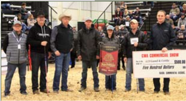
Grand Champion of Open Replacement Heifers - 619 Land & Cattle