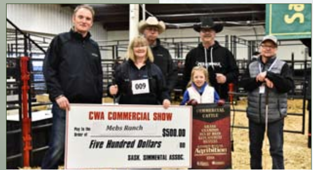
Grand Champion Pen of Bred Replacement Heifers - Blairswest Land & Cattle

Yorkton Harvest Showdown and Canadian Western Agribition on strong shows & sales last fall!