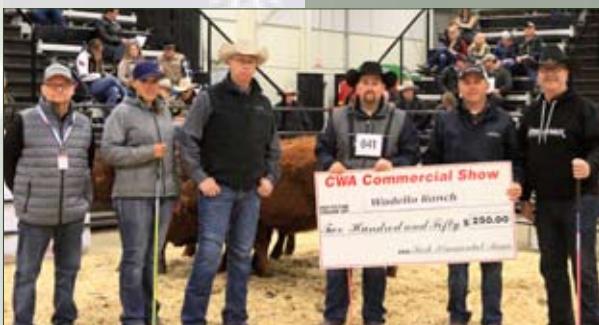
Reserve Grand Champion of Open Replacement Heifers - Wadella Ranch