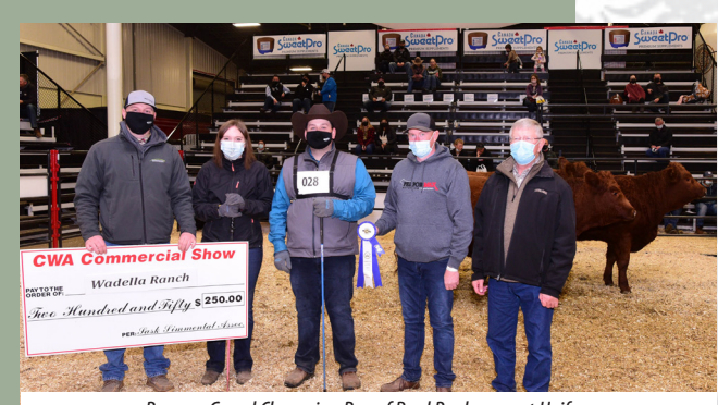
Reserve Grand Champion Pen of Bred Replacement Heifers Wadella Ranch, Kennedy, Sk