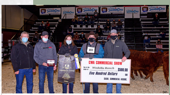
Grand Champion Pen of Open Replacement Heifers Wadella Ranch, Kennedy, Sk

Congratulations! to all the Exhibitors at