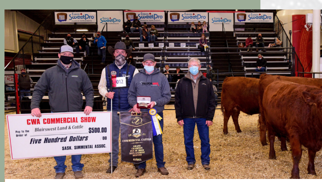
Grand Champion Pen of Bred Replacement Heifers Blairswest Land & Cattle Ltd., Drake, Sk

All of the Agribition Commercial Champions were Simmental Influenced!