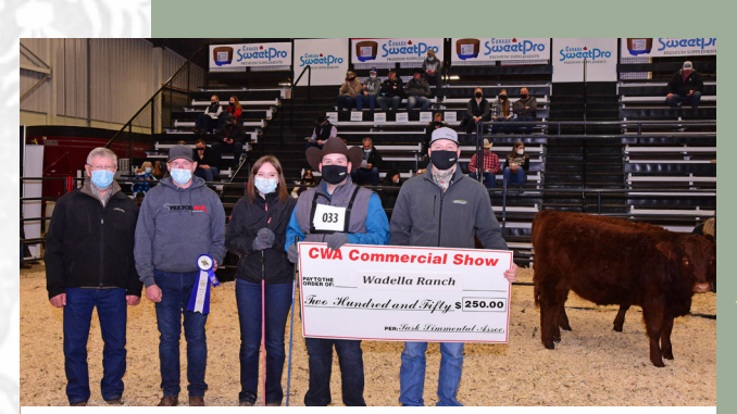
Reserve Grand Champion Pen of Open Replacement Heifers Wadella Ranch, Kennedy, Sk